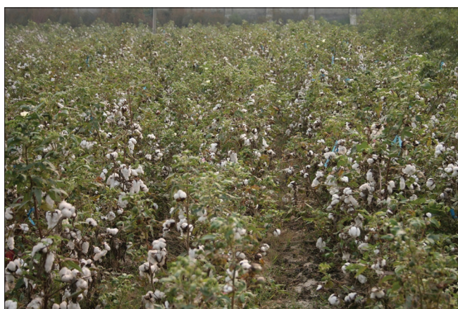
Fig 4. A field view of the crop during boll opening period.

individual seasons/environment and owing to similar trend of results for both study years, data has been pooled by keeping seasons/environment as a main plot factor to enhance the precision for drip irrigation and nitrogen fertigation. Fisher's LSD ( p=0.05 ) has been employed to compare the difference among means.