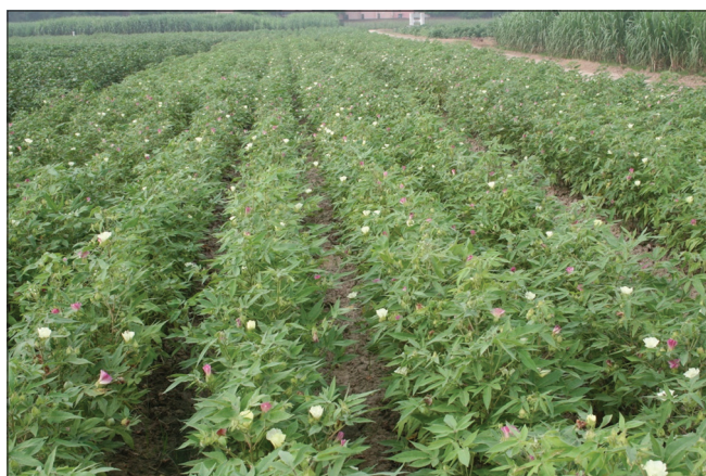
Fig 3. A field view of the crop during peak bloom stage.

Analysis of variance has been carried using SAS software 9.4 (SAS, 2017 Institute, Cary, NC,US) separately for