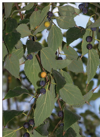
Fig 1. Hackberries ( Celtis australis L.) fruits.

Hackberry matter (1 g of peel or flesh) was ground with 5 mL of the corresponding HPLC eluent as extractant, using an Ultraturax type blender. The solution was centrifuged at