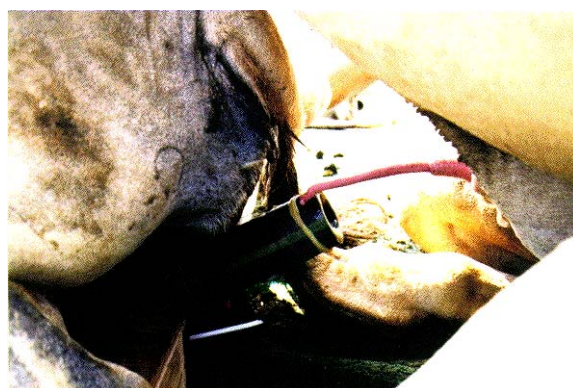
Figure 5. The location of the underground loophole between the thighs of the teaser female camel while the operator passing the AV through the loophole and directing it towards the penis.

Most camels with training accepted this approach of semen collection. Therefore, successful mounting, intromission and ejaculation took place. Semen collection was fulfilled in 88 times out of 96 attempts (84.5%). For the other 15.5% attempts, male camels refused to enter the collection area. This technique of semen collection enabled full observation of copulatory behaviour and pattern of ejaculation while the operator was in the underground room. Erection of the penis occurred only after the male had mounted the female in a sitting position. Then the partially erect penis probed the female's perineum to locate the vulva, during which the AV was guided towards the penis (Figure 5). The penis was fully extended upon penetration inside the AV. Following intromission, friction movements of the penis occurred in association with its rotational movements. The male then made himself very close to the female. The appropriate position of the AV just below the female's vulva, between her thighs allowed successful collection without interrupting copulation.