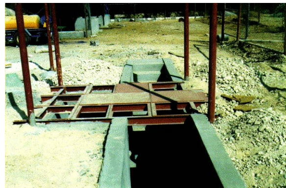
Figure.1. View of the underground room with entrance and exit while under construction.

After several trials of using bull's, ram's, boar's and open-ended artificial vaginae, a new bull's AV was developed for the camel. The modified AV was 30cm in length (Figures.4), supplied with a cervix-like cork (inserted at the distal end of the inner liner). The AV was filled with water at 60-70°C to give an internal temperature of 40-42°C.