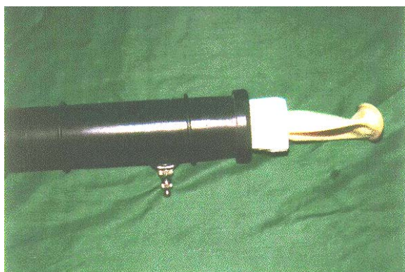
Fig.4. The modified AV showing the inner liner surrounded by cervix-like cork.

Semen collection was performed once a week for each male during the breeding season from November to February. A teaser female camel was tied up in sternal recumbancy on the wooden board of the collection area so that the underground loophole was between her thighs. The male camel was allowed to enter the collection area, sniff, perform flehmen and mount. When the male attempted to introduce his penis in the vagina, the operator in the underground room opened the loophole. The AV was then passed through the