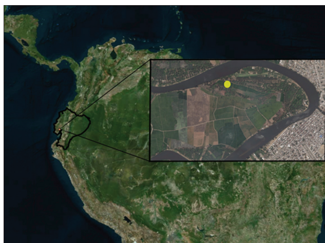
Fig 1. Location of the study, Daule, Ecuador.

LC 50 values presented in the Table 1 probed that Sapindus saponaria L. 100% was more toxic than the mixture Sapindus saponaria L. and Solanum mammosum L. (50:50, w/w). and LC 90 values indicated that both formulations could not be considered as good molluscicide candidates due to the fact that WHO prerequisites indicate that crude organic extracts should present LC 90 values bellow 20 ppm for direct application in infested water (WHO, 1983b).