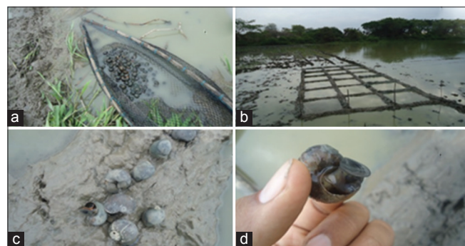
Fig 2. Field Trial Scheme. (a) Collection of snails; (b) Design of square-shaped plots; (c,d) Dead snails.